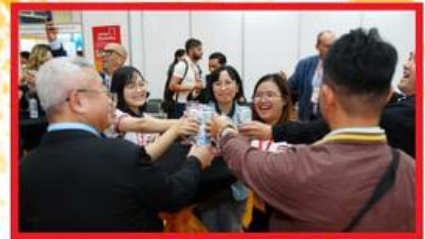
Networking Beer Session

Do not miss ASEAN CERAMICS & ASEAN STONE 2024 - Your Gateway to latest Ceramics and Stone's products & innovations in the region!