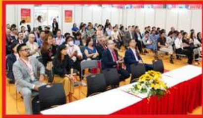
Conference & Panel Discussions