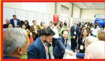
Hosted Buyer & VIP Buyer